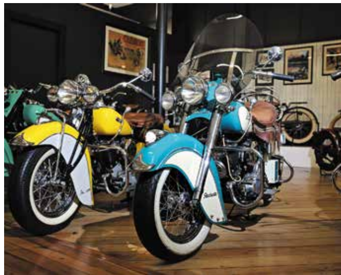
Discover vintage motorcycles and history at the Classic Motorcycle Mecca.