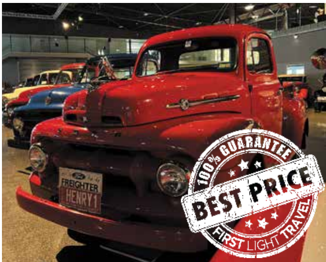
Bill Richardson Transport World, home to more than 300 rare vintage vehicles.

SPEND 3 NIGHTS IN QUEENSTOWN Experience the breathtaking beauty of Queenstown with an unforgettable three-night stay. Nestled on the pristine shores of Lake Wakatipu, this alpine paradise offers breathtaking scenery, thrilling outdoor activities, and vibrant nightlife. Discover the region's renowned vineyards, historic mining towns and picturesque streets. Savour gourmet dining and unwind in cozy accommodations while surrounded by majestic mountains.