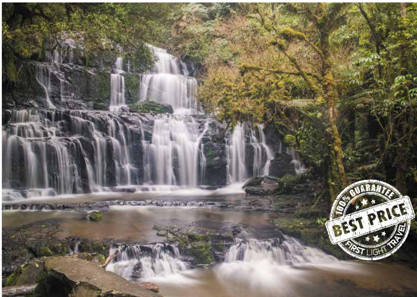
Visit the spectacular triple tiered cascading waterfall at Purakaunui, part of the remarkable region of The Catlins.

Your crew are available to help you choose from the many optional activities available. This evening is also free to dine at one of the many fine restaurants.