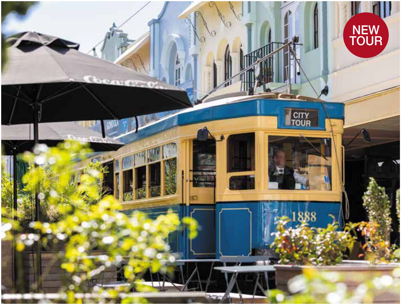
The Christchurch Tram is one of the city's leading attractions.