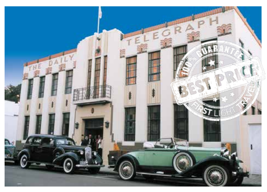
Enjoy an overnight stop in Napier, known as 'The Art Deco Capital'.

This morning board the TranzAlpine, renowned as one of the great train journeys of the world. Travel over massive viaducts, river valleys and spectacular gorges as you ascend to Arthur's Pass located in the centre of the Southern Alps. Board your Ultimate Coach and travel to Hokitika, famous for its Greenstone before continuing via Franz Josef to the township of Fox Glacier where time is available to