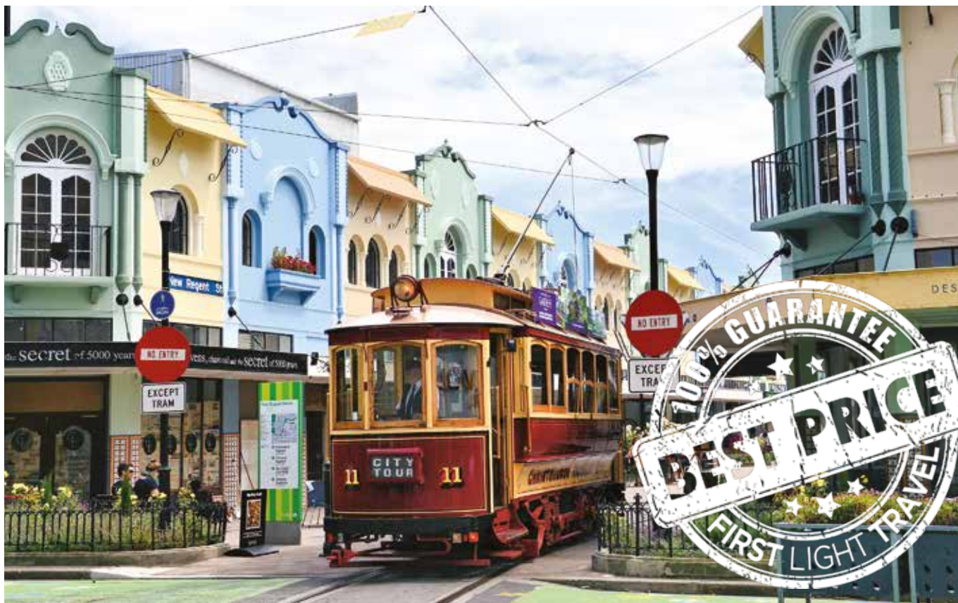
The Christchurch Tram is one of the city's leading attractions.