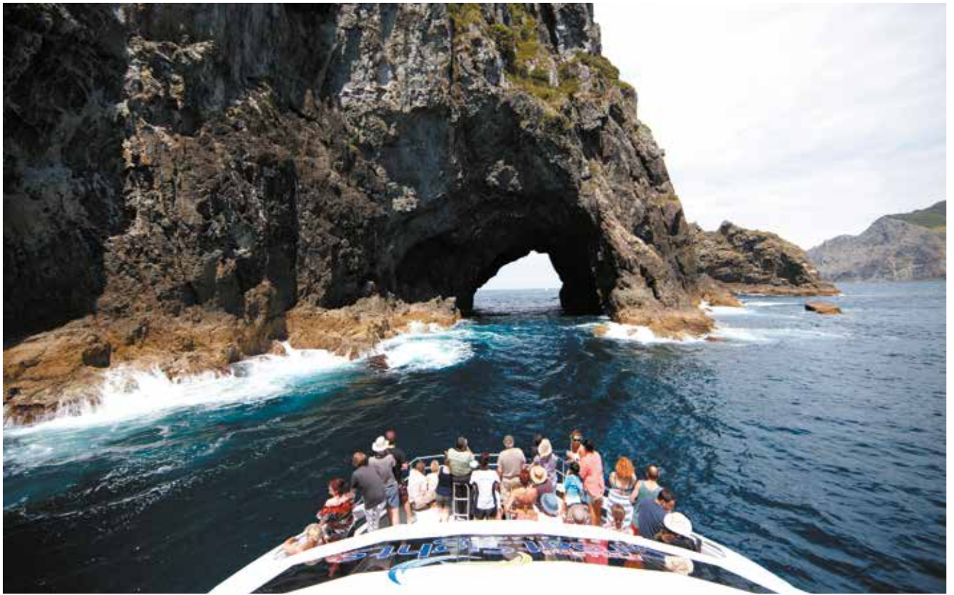
Above: Cruise through the beautiful Bay of Islands to Piercy Island, or as it's popularly known, the Hole in the Rock. Below: Visit mud pools and geysers at the geothermal wonderland of Te Puia.