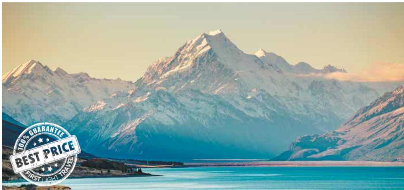
Marvel at spectacular mountain ranges including Mt Cook, New Zealand's highest peak.