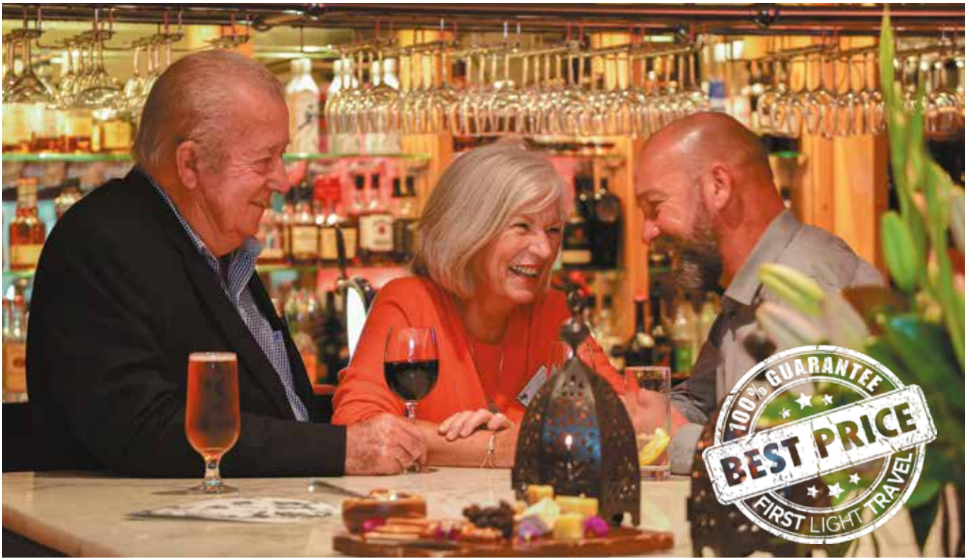
Meet like-minded people and make lifelong friends.