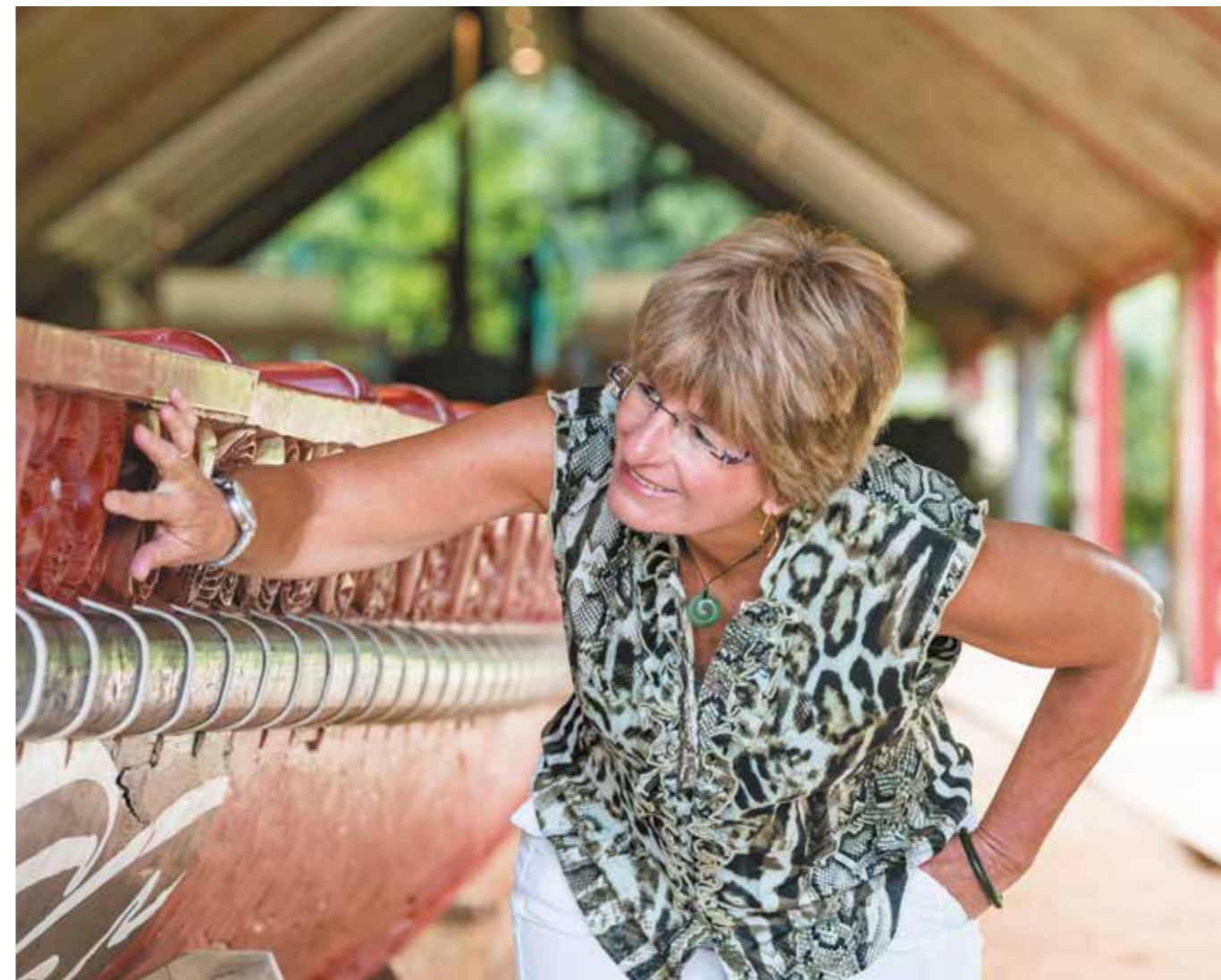
Waitangi Treaty Grounds, New Zealand's most important historic site.