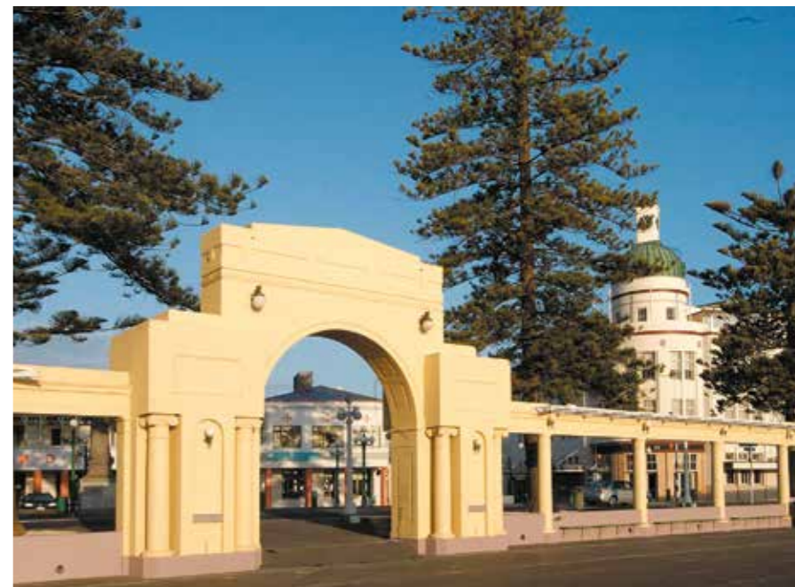
Enjoy an overnight stop in Napier, known as 'The Art Deco Capital'.

This morning board the TranzAlpine, renowned as one of the great train journeys of the world. Travel over massive viaducts, river valleys and spectacular gorges as you ascend to Arthur's Pass located in the centre of the Southern Alps. Board your Ultimate Coach and travel to Hokitika, famous for its Greenstone before continuing via Franz Josef to the township of Fox Glacier where time is available to experience a scenic flight (optional, weather permitting) over the spectacular glaciers. Hotel Distinction Fox Glacier