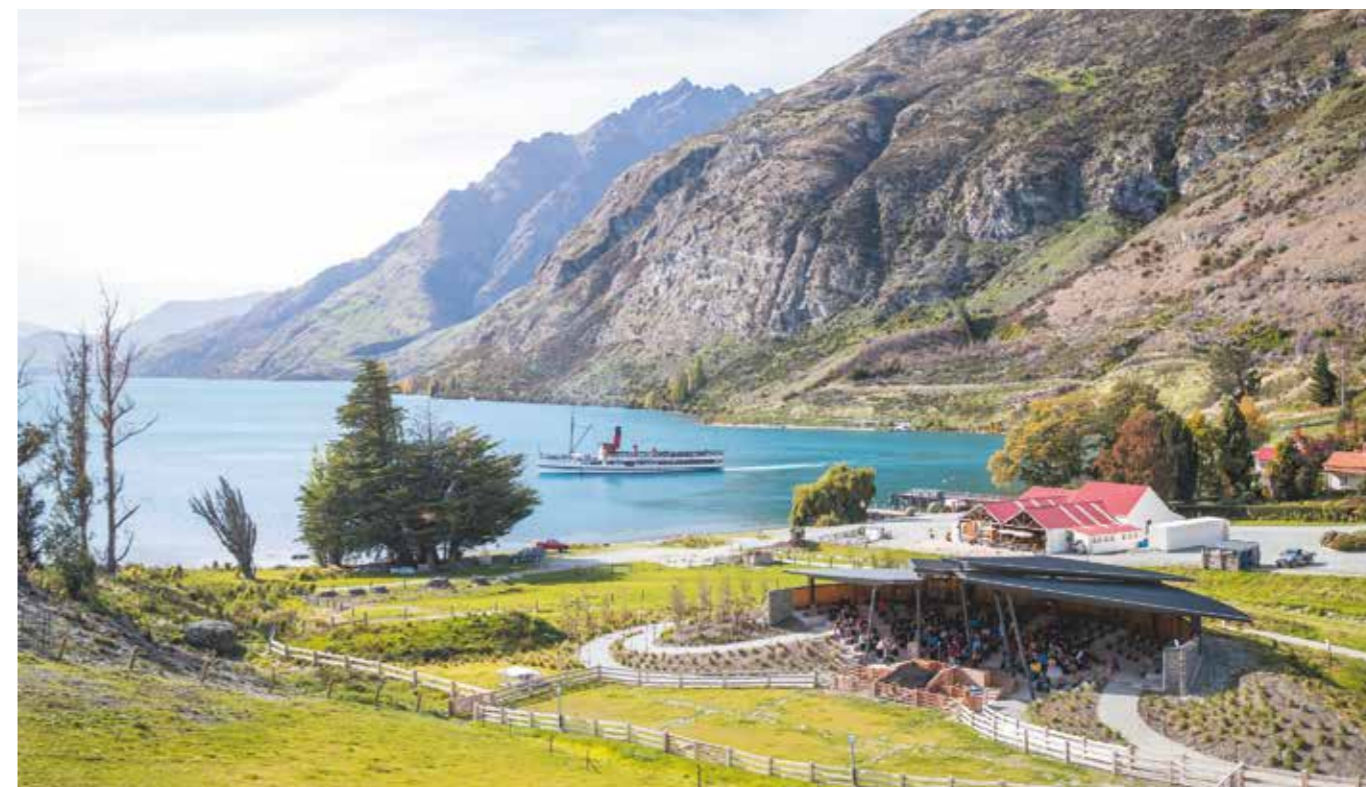
On Christmas Day, board the steamship TSS Earnslaw and cruise to Walter Peak Station to enjoy a gourmet celebration lunch and the best of NZ's high-country cuisine.

Hotel Millennium Hotel Queenstown (2 nights)