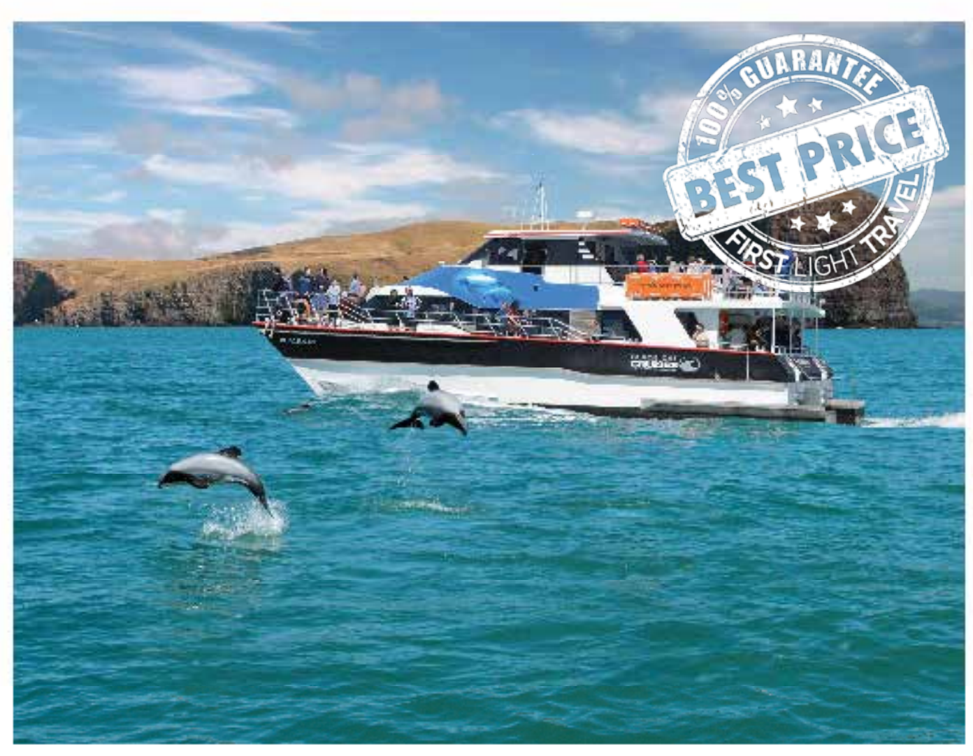
in Alasco enjoy a Haituse Cruins and Israp a bodicut for the rais Hardor's Dolptin and other san blick.