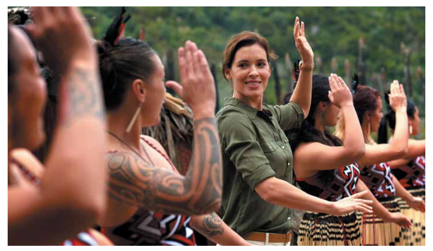
You will be immersed in the traditions and customs of Maori culture in Rotorua.