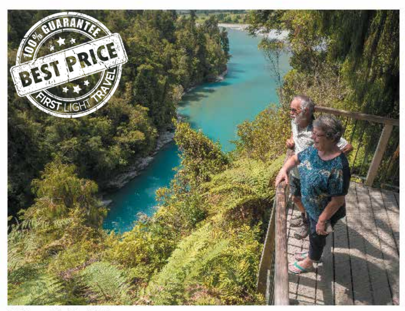
Bripy the normary of the charring Hotelian Gorge.

DAY 7: Nalece - Electralm (ELELL) Today travel via Havelock and the winegrowing region of Meditorough. Vieil the Omelo: Aviation Haritage Cantra, home to one of the largest private collections of WW1 Aircraft, brought to life in sets creeted. by the internationally acclaimed WingNut Films and Wata Workshop. Hand back into town where you will enjoy funch at a local Blanheim beer gerden belore a short drive to Cloudy Bay Éalais. Eatablished in 1996, Cloudy Bey was one of the original wineries in the region. Enjoy a personalized teating experience in the Barriel Floorn followed by time to wander through the euperb. manicured grounds and towaring gum trace, which will eurally be a highlight. Hotal Scanic Hotal Mailborough (2 nights)