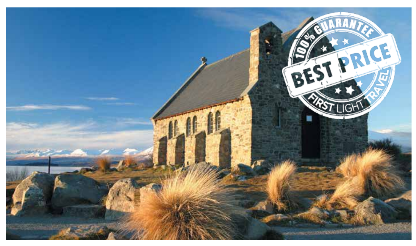
The Church of the Good Shepherd is a landmark of the Mackenzie region.