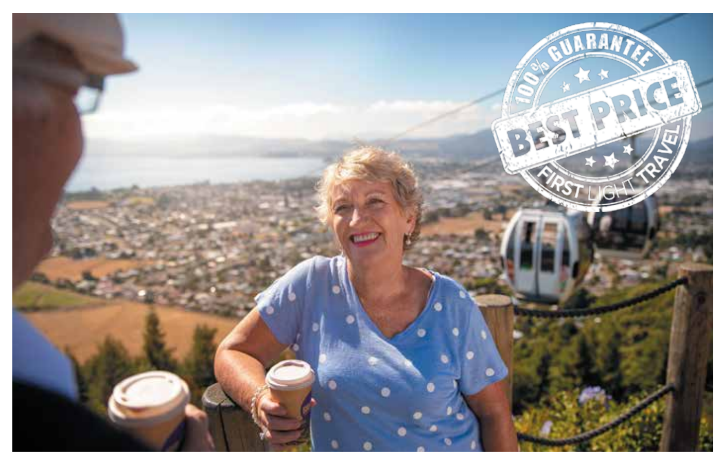
Enjoy the surrounds and activities on offer at Skyline Rotorua Gondola and Luge.