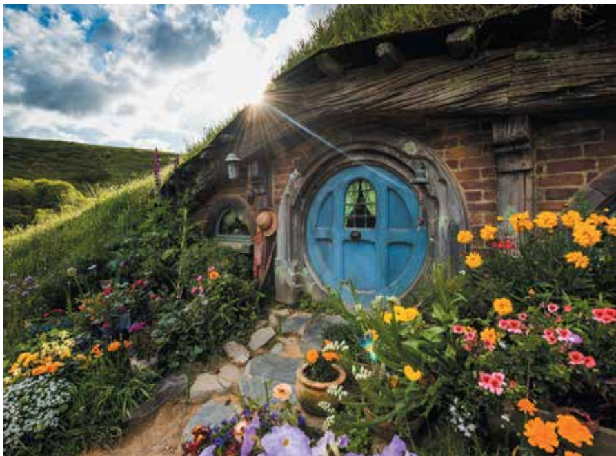
Experience the real Middle-earth on a tour of the Hobbiton Movie Set.

Hotel Scenic Hotel Franz Josef Glacier (Douglas Wing)