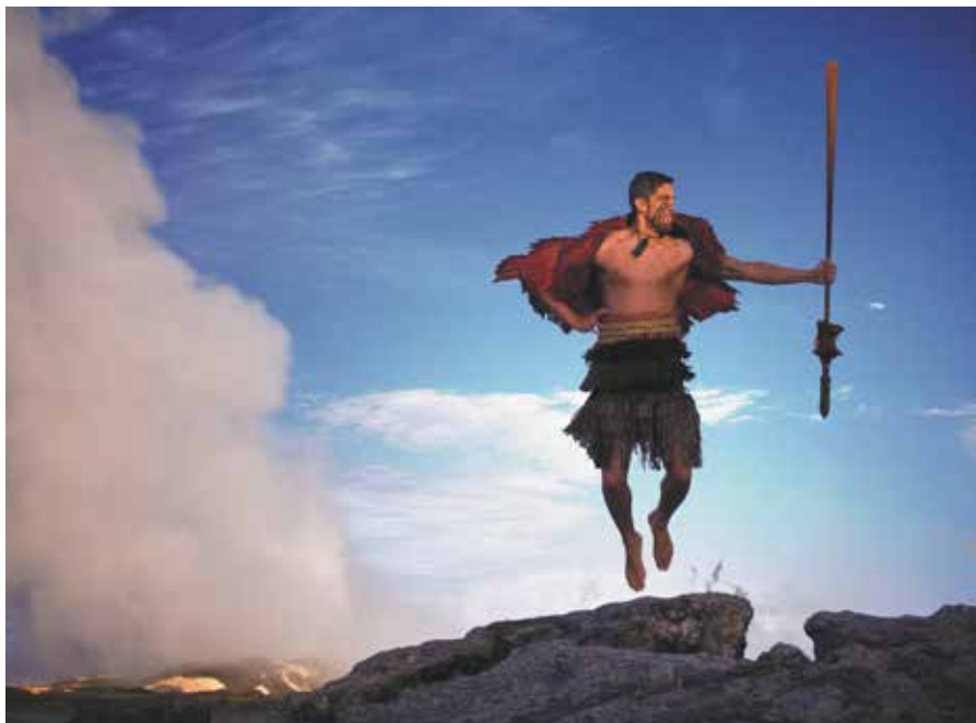
At Te Puia you will enjoy an entertaining Māori cultural performance which features the ferocious haka.

Hotel Scenic Hotel Franz Josef Glacier (Douglas Wing)