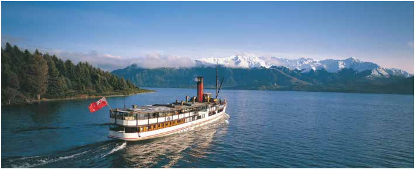
On Christmas Day board the vintage steamship TSS Earnslaw and cruise across Lake Wakatipu to Walter Peak Station.