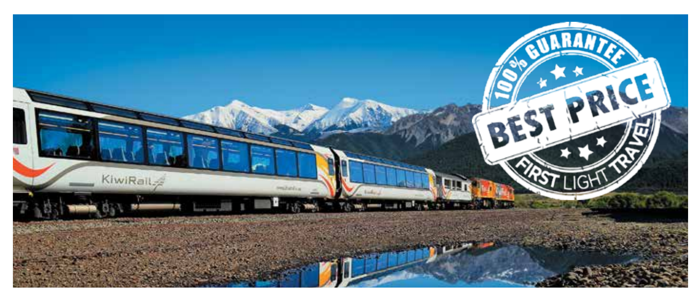
On the TranzAlpine rail journey, traverse the majestic Canterbury Plains and view the spectacular backdrop of the mighty Southern Alps.

which offers a wide range of activities and attractions. This evening is free, you may choose to dine at one of the many fine restaurants.