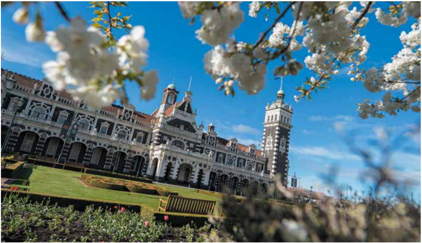
Dunedin Railway Station, one of the city's most prominent architectural landmarks.