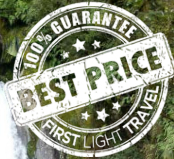
Milford Track Walk