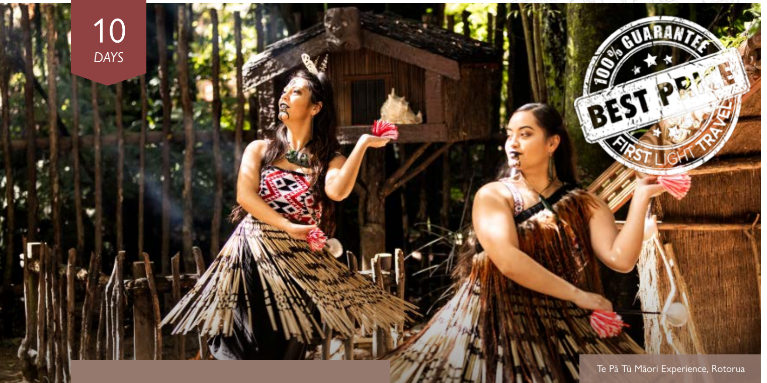
Te Pā Tū Māori Experience, Rotorua