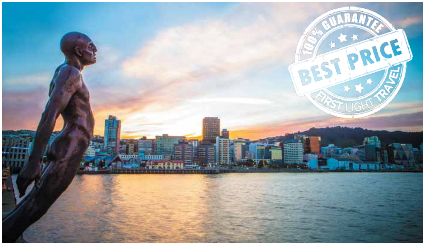
Take a walk along Wellington's waterfront.