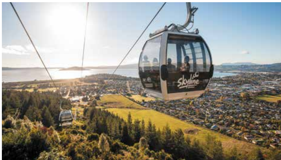
Enjoy spectacular views of Rotorua on a gondola ride up to Skyline Rotorua.

Time to say goodbye. You will be transferred to the airport for your flight home after a memorable New Zealand holiday.