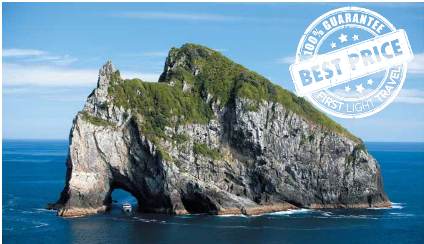
Cruise through the beautiful Bay of Islands to Piercy Island, or as it's popularly known, the Hole in the Rock.