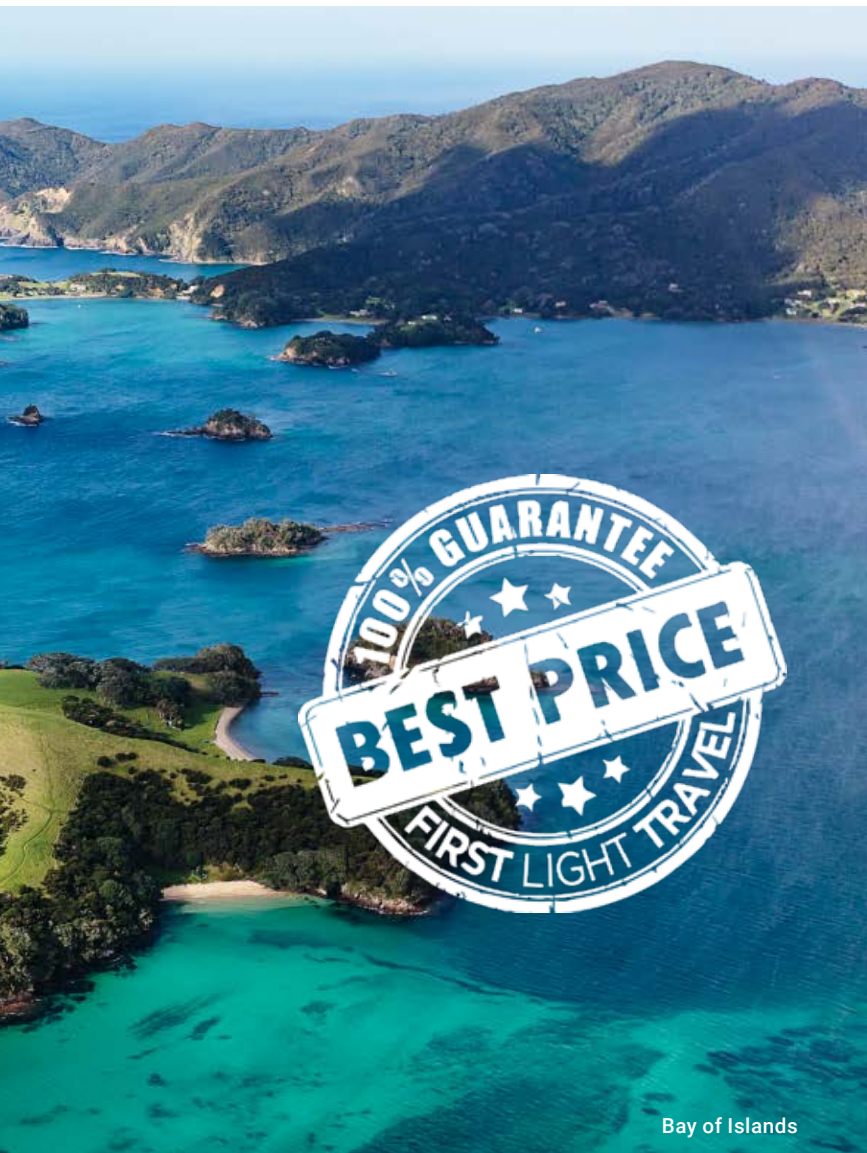
Bay of Islands