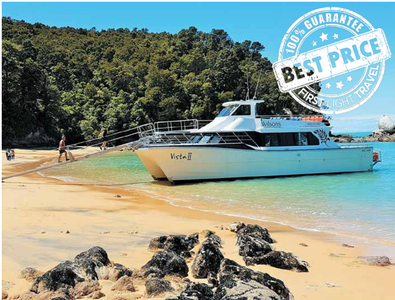
Enjoy the morning exploring the natural wonders on a cruise to the Able Tasman National Park.