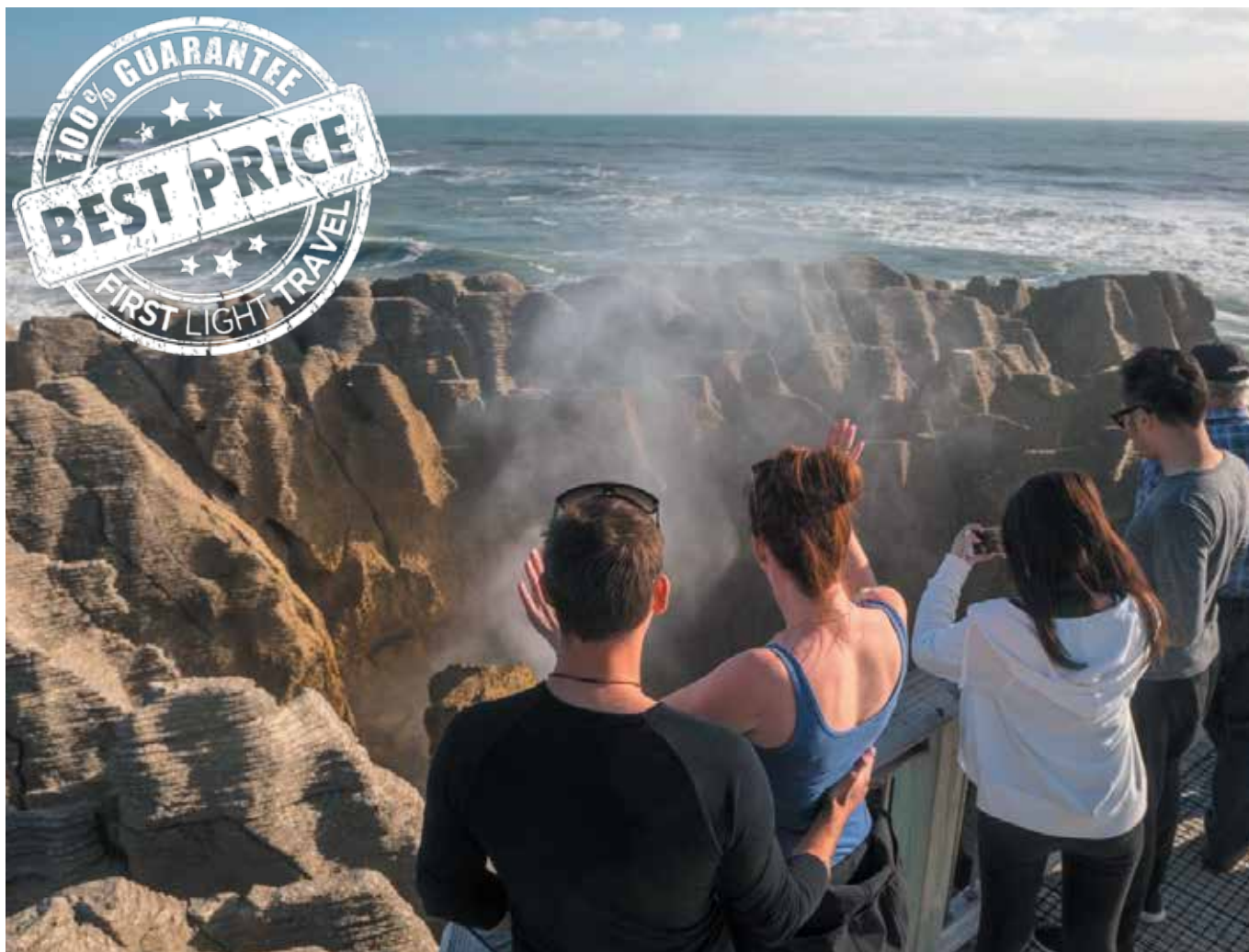
Punakaiki Pancake Rocks and Blowholes Walk.