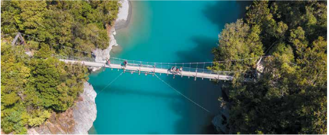
Experience the scenic beauty of Hokitika Gorge from the suspension bridge over Hokitika River.