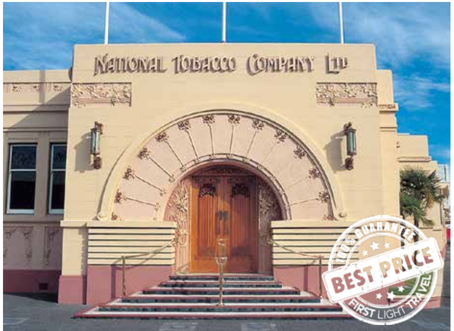
Enjoy an overnight stop in Napier, known as 'The Art Deco Capital'.