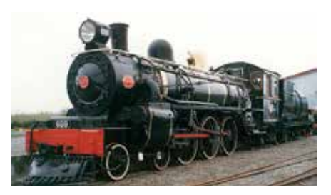
PLEASANT POINT RAIL EXPERIENCE Nestled in the small town of Pleasant Point is a museum and railway housing two steam engines, one of the world's only Model T Ford railcars and a 137-year-old station. A small army of volunteers work hard to preserve New Zealand's railway history.