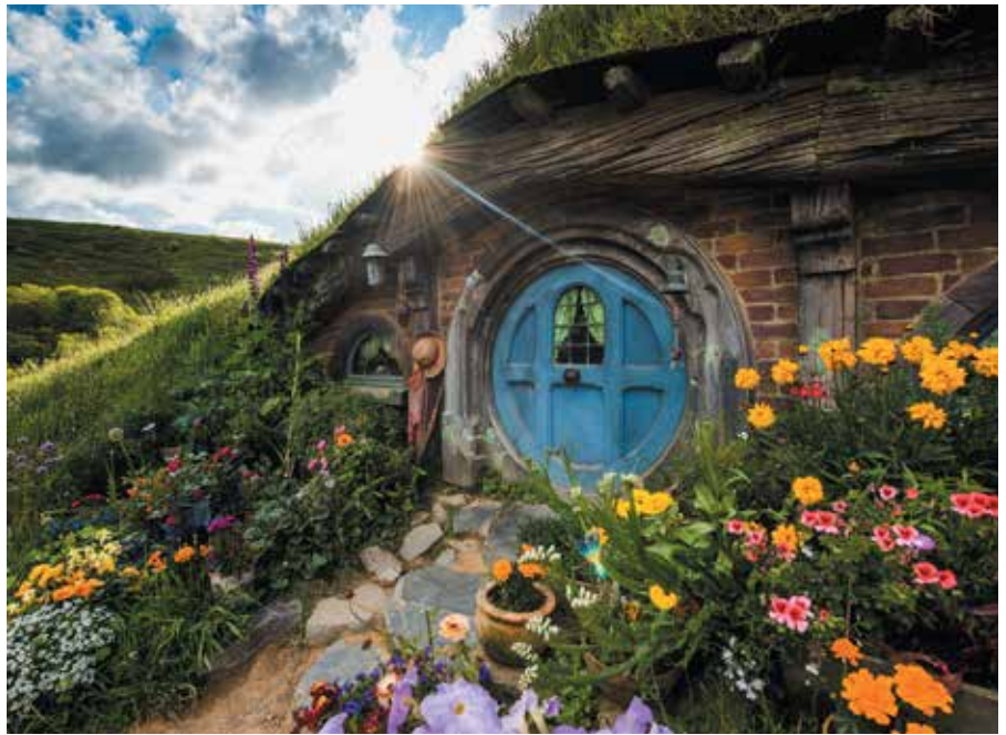
Experience the real Middle-earth on a tour of the Hobbiton Movie Set.

Hotel Scenic Hotel Franz Josef Glacier (Douglas Wing)