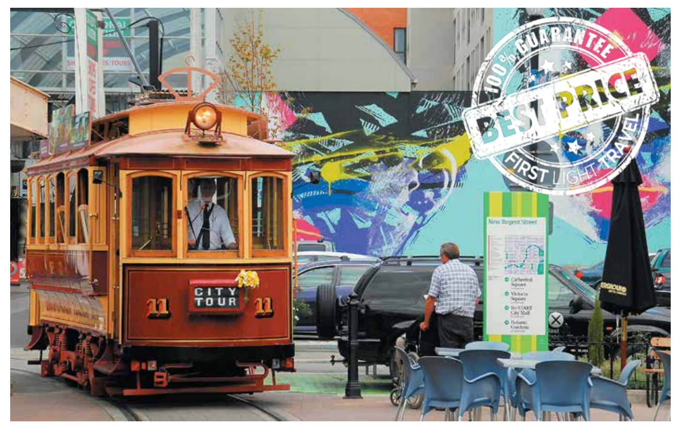
The Christchurch Tram is one of the city's leading attractions.