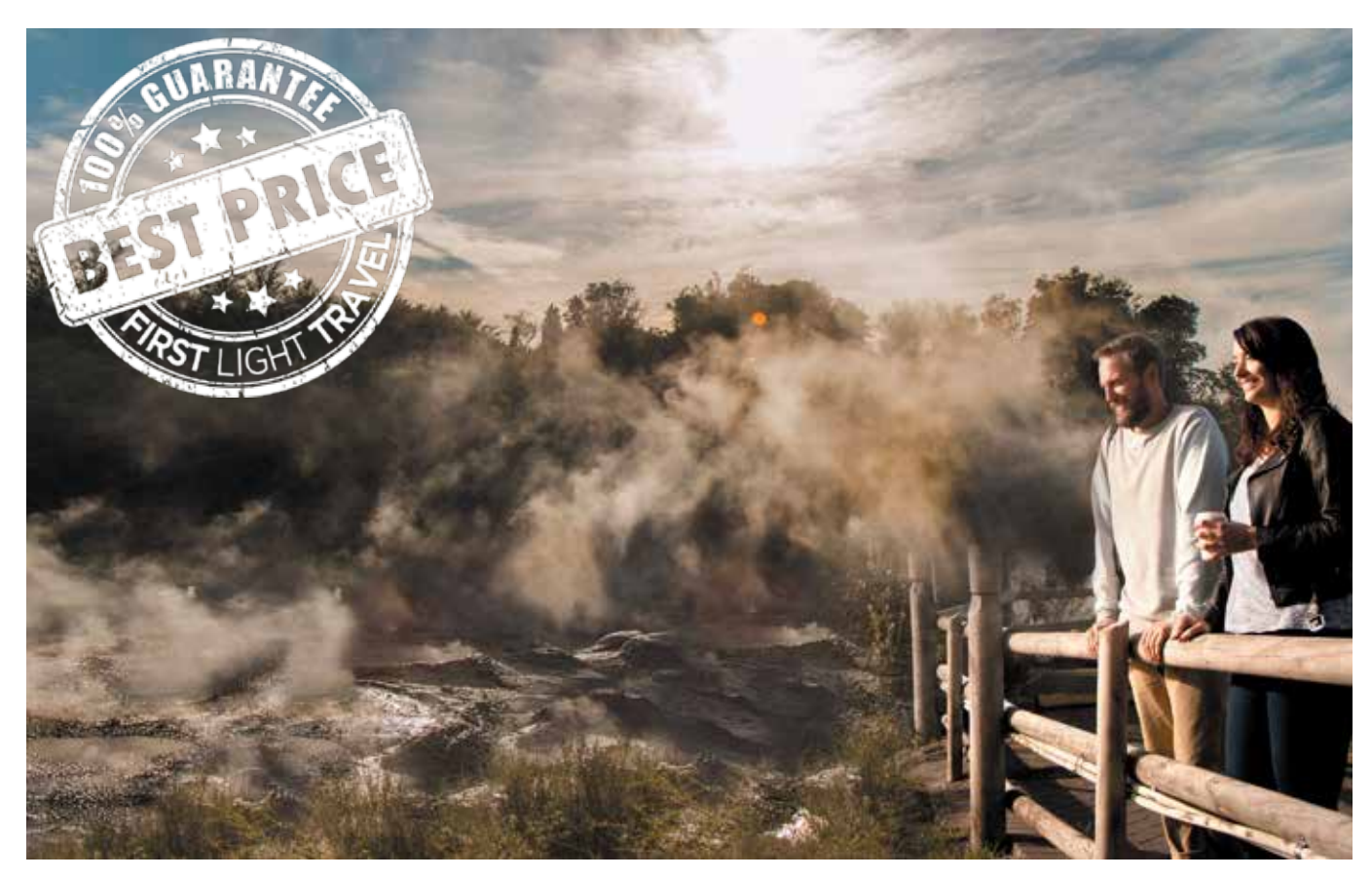
Visit mud pools and geysers at the geothermal wonderland of Te Puia.