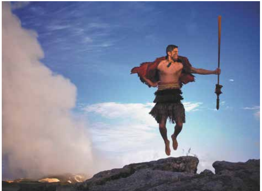
At Te Puia you will enjoy an entertaining Māori cultural performance which features the ferocious haka.

Hotel Scenic Hotel Franz Josef Glacier (Douglas Wing)