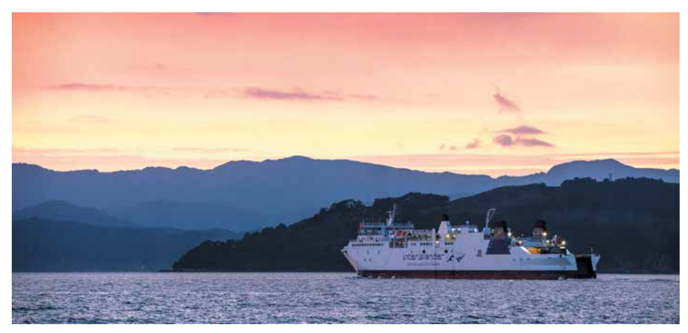
On the Interislander Ferry cross the Cook Strait and travel through the Marlborough Sounds to Picton.