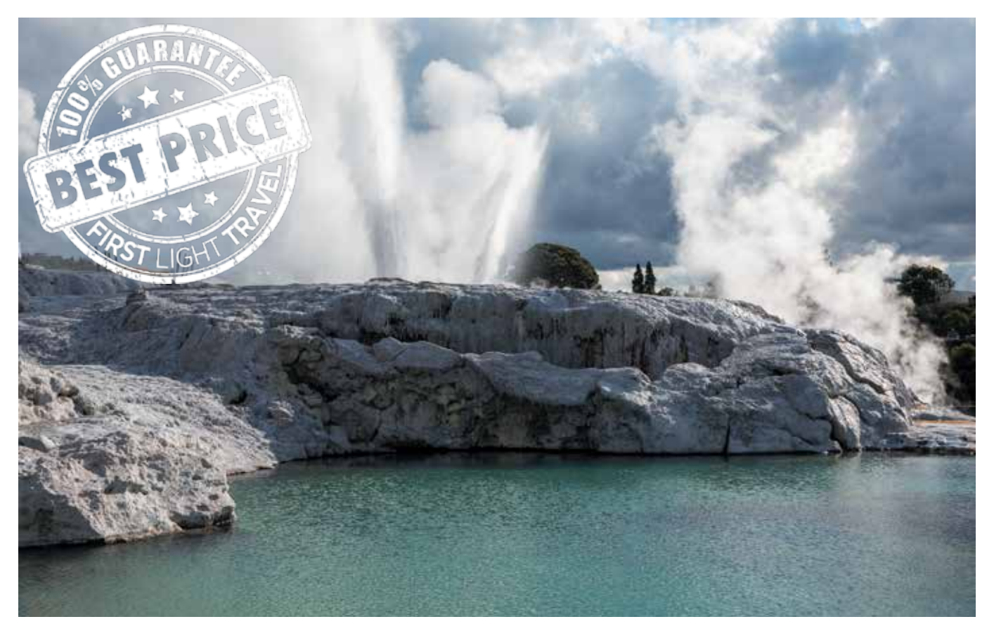
Pohutu Geyser in Rotorua is the largest in New Zealand and can reach heights of up to 30 metres.