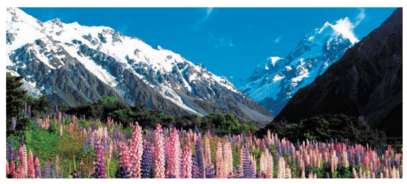
Marvel at spectacular mountain ranges including Mt Cook, New Zealand's highest peak.