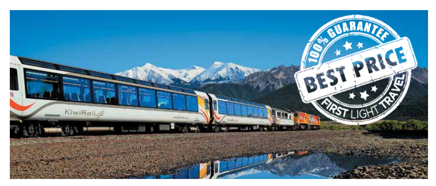
On the TranzAlpine rail journey, traverse the majestic Canterbury Plains and view the spectacular backdrop of the mighty Southern Alps.

which offers a wide range of activities and attractions. This evening is free, you may choose to dine at one of the many fine restaurants.