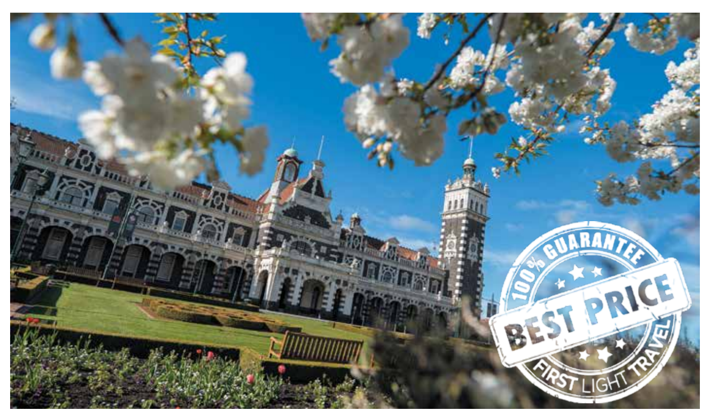
Dunedin Railway Station, one of the city's most prominent architectural landmarks.