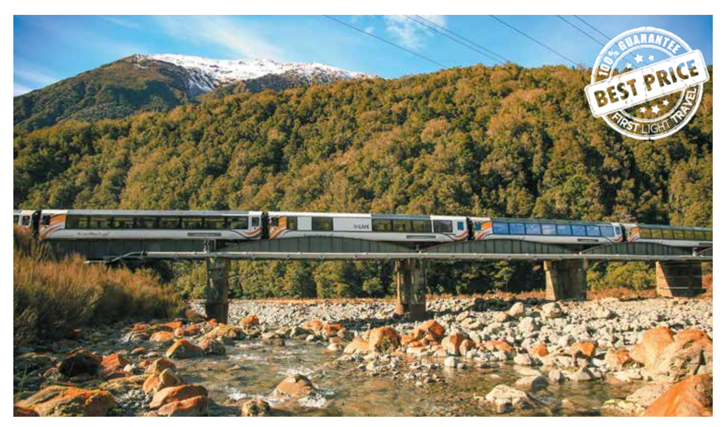
The TranzAlpine, renowned as one of the great train journeys of the world.