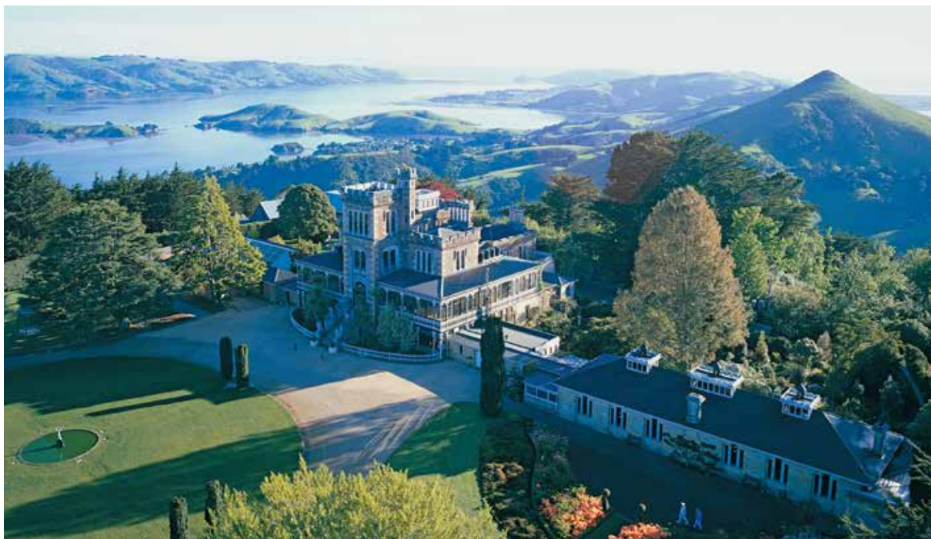
Enjoy a tour of Larnach Castle, New Zealand's only castle, built in 1871.