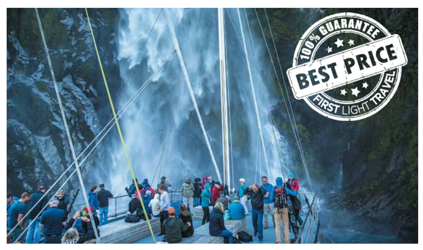
Whilst cruising in the magnificent Milford Sound, see the spectacular Bowen Falls.