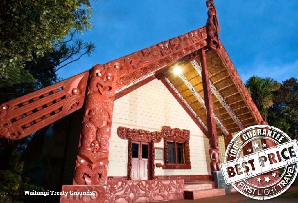
Waitangi Treaty Grounds