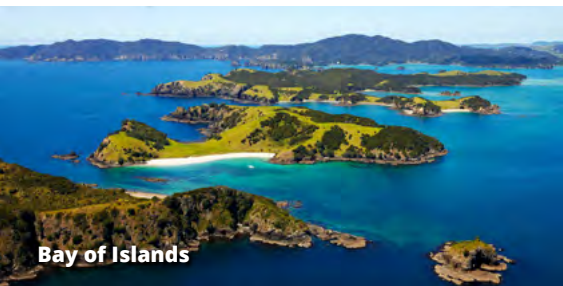
Bay of Islands