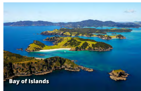
Bay of Islands