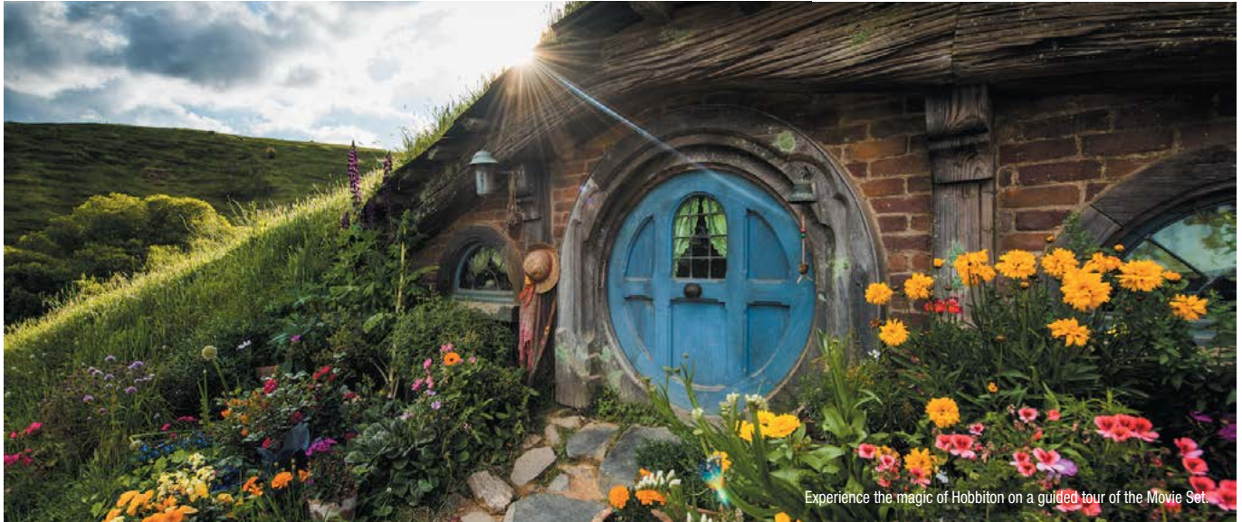
Experience the magic of Hobbiton on a guided tour of the Movie Set.