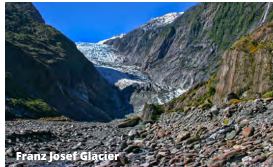
Franz Josef Glacier

Bid farewell to your fellow travellers when your holiday comes to an end this morning after breakfast. B