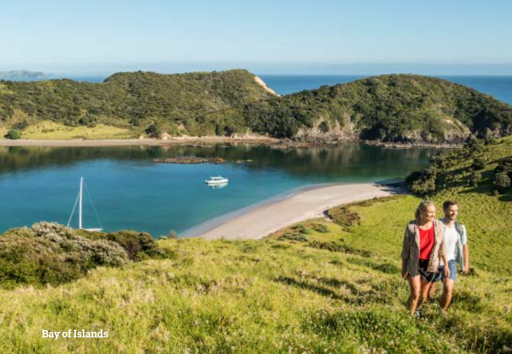
Bay of Islands