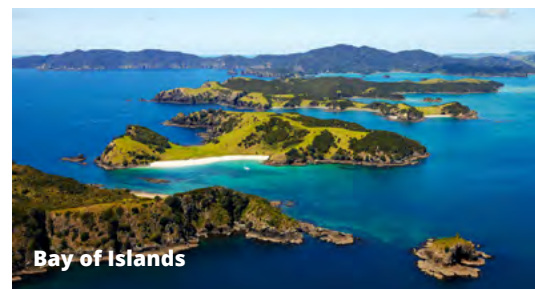
Bay of Islands