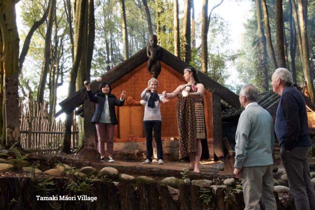
Tamaki Māori Village