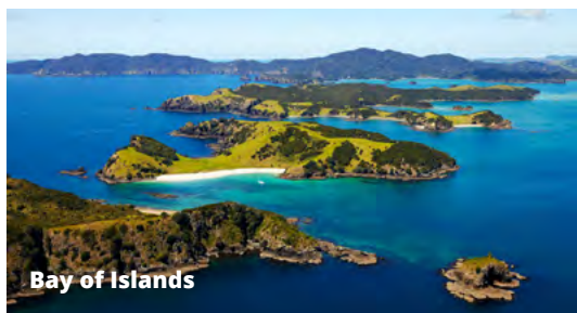
Bay of Islands