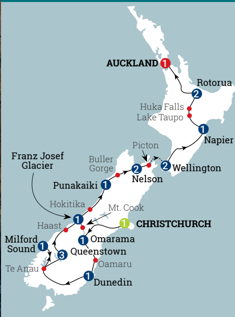
Punakaiki Pancake Rocks