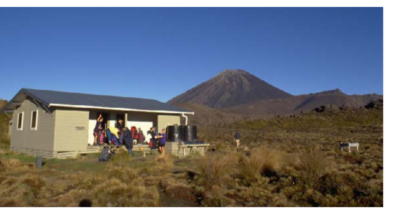
Lodges - You will stay in lodge type accommodation on some of the nights. The lodges are often conveniently located near the start or end of a hike and have multi-share and sometimes twin/double rooms.

Huts - New Zealand has an excellent network of backcountry huts and you will stay in huts on several nights. They are equipped with mattresses, running water and an outside toilet. Cooking is done on a portable stove. Huts are only accessible on foot and shared with other hikers. You also have the option of camping near the hut if that is your preference.