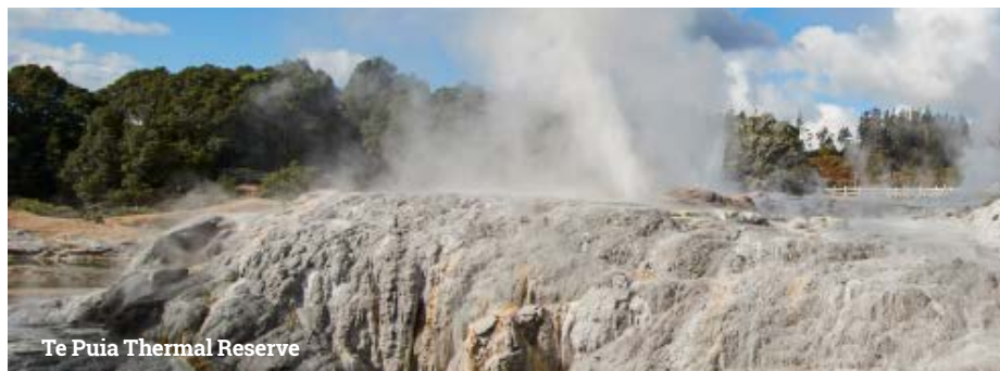
Te Puia Thermal Reserve

CONTACT US TODAY FOR THE BEST PRICES AND SERVICES