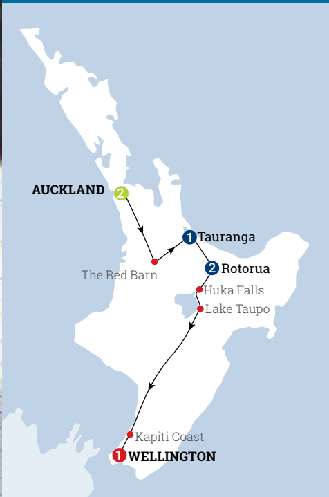
The Red Barn