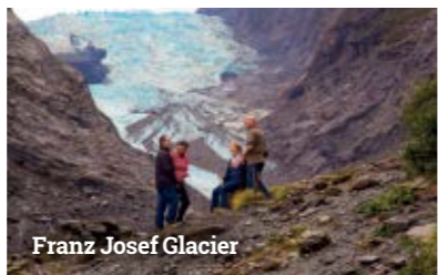
Franz Josef Glacier