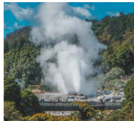
TOP TO BOTTOM: Sculptureum, a unique art experience; discover the traditions of Maori Culture; see awesome Geysers in Rotorua.