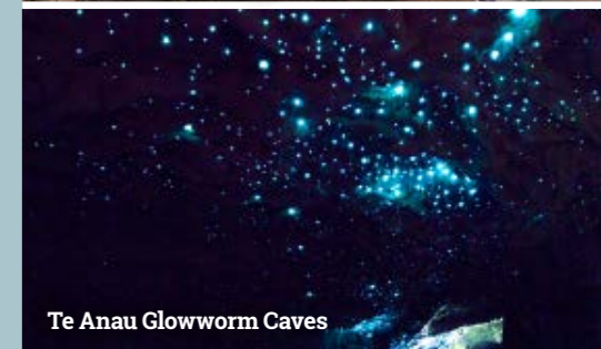
Te Anau Glowworm Caves