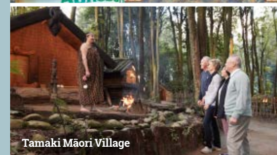
Tamaki Māori Village