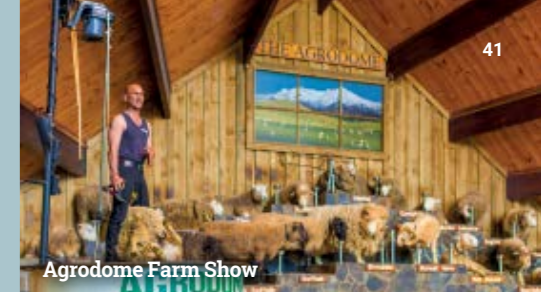
Agrodome Farm Show

Say farewell to your fellow travellers when your holiday comes to an end this morning after breakfast. B