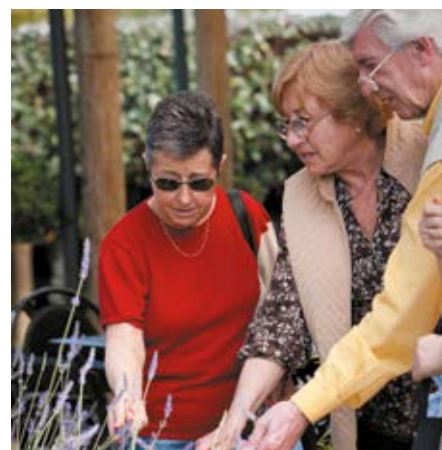
TOP TO BOTTOM: The TranzAlpine rail journey; enjoy Christmas lunch with all the trimmings at the Walter Peak Homestead; witness geothermal activity in Rotorua; travel with like-minded people.