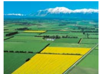
CLOCKWISE FROM FAR LEFT: Cruise aboard the vintage steamship TSS Earnslaw to Walter Peak; Agrodome, an educational hands on experience; the patchwork plains of the Canterbury region; Waitangi Treaty Grounds.