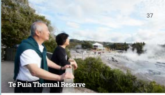
Te Puia Thermal Reserve