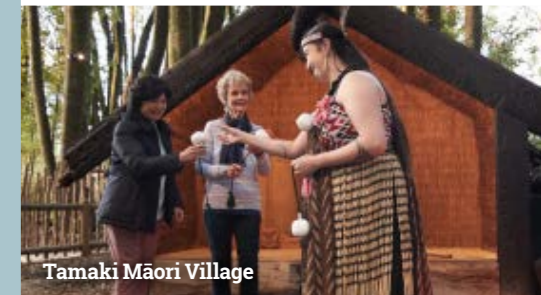
Tamaki Māori Village